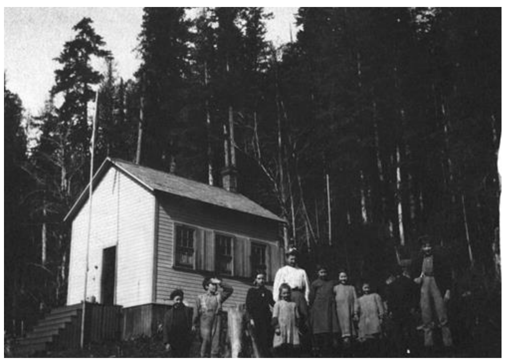
Was located at the SE corner of NE 8th St. and 228th Ave NE (currently the Safeway Shopping Center)

There were lots of children in early Inglewood, and there was a school there for them too: The Inglewood Grammar School. The school was probably built in the early 1890s -- it is documented to be in existence in 1895 -- and operated until 1920, when it consolidated with other small area schools into the Redmond School District. It was located on the southeastern corner of NE Eighth Street and 228th Avenue NE in Sammamish, near where the Sammamish 76 service station is located today in the Sammamish Highlands Shopping Center. Originally built as a simple log building, by 1900 the school had been replaced by a more substantial structure. The school was a